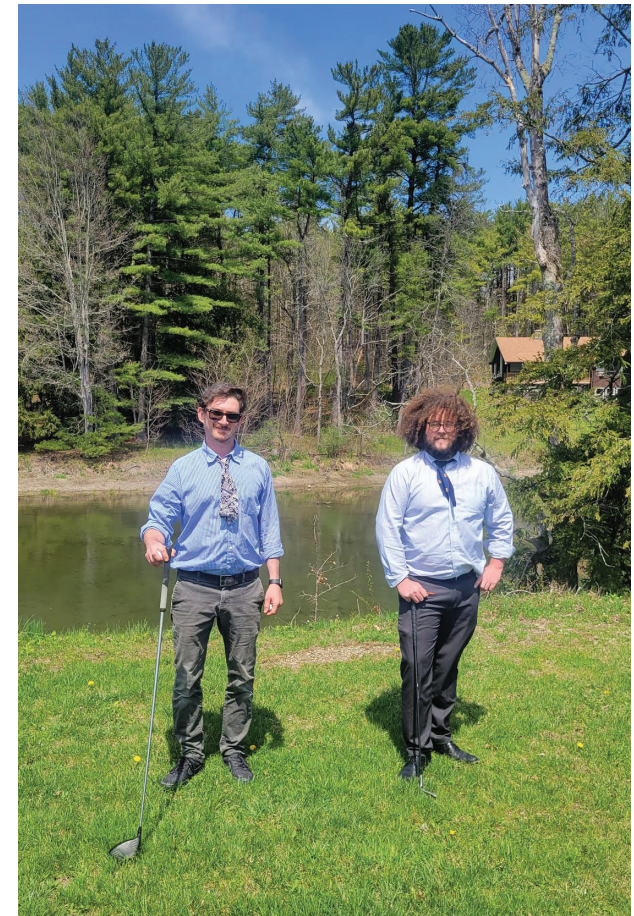
Art and literary faculty enjoy a spring round of golf on the lawn.