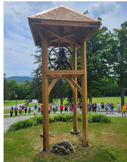
The Bell Tower was officially dedicated during Reunion Weekend 2022. The new post & beam bell tower was constructed with timber harvested from the woods of Hoosac and created by Asa Clark '01 with design aid from students and faculty