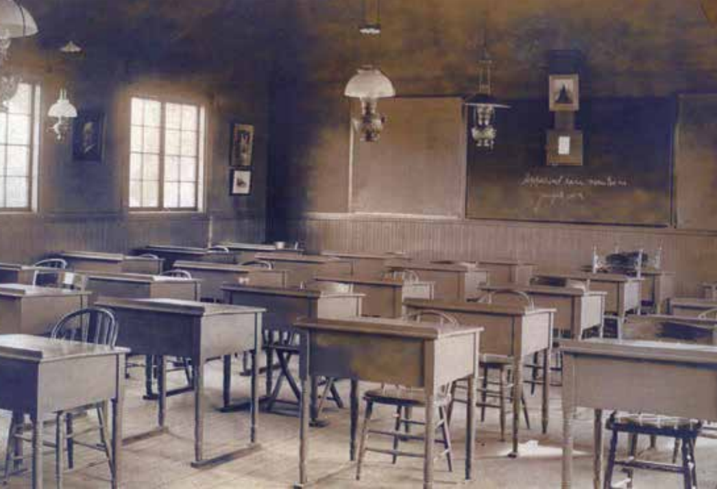
A classroom view at Hoosac School's old campus sometime around 1900

MAY WE ALWAYS CONTINUE TO HOLD ON TO WHAT TRUE SPIRIT OF LOYALTY AND DEVOTION WHICH SHALL ENABLE US TO KEEP ALIVE EVERY WORTHY TRADITION OF THE PLACE.